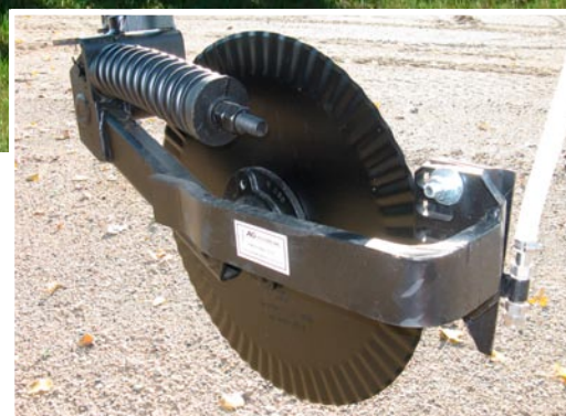
New Gen III minimum maintenance Coulter