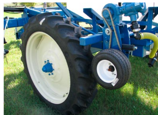
Adjustable Drive tension for positive traction